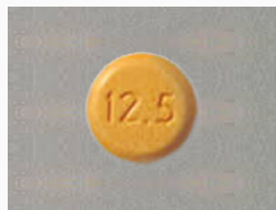
Adderall 12.5mg $382.00 – $982.00