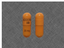
Adderall XR 20mg $268.00 – $768.00