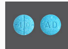
Adderall 10mg $399.00 – $999.00