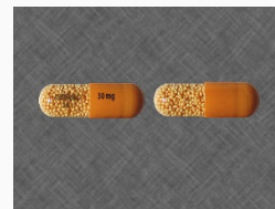
Adderall XR 30mg $279.00 – $819.00