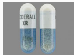
Adderall XR 15mg $284.00 – $587.00