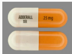
Adderall XR 25mg $389.00 – $989.00