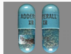
Adderall XR 10mg $387.00 – $978.00