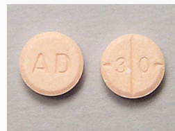
Adderall 30mg $269.00 – $799.00