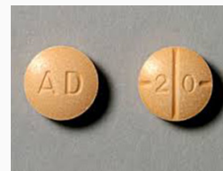
Adderall 20mg $385.00 – $985.00