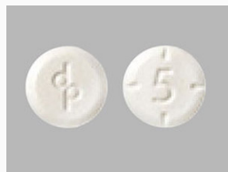
Adderall 5mg $380.00 – $980.00